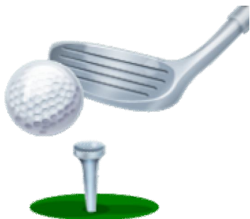
Blue Thunder Golf Play Day

Again, the boosters thank you for your support along with the coaches and athletes!!